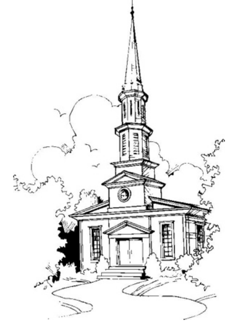
Page 10 of 12

*A LARGE PRINT VERSION OF THIS BULLETIN IS AVAILABLE AT THE USHER'S TABLE.